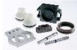
#784-90615 (Not Shown) #784-90611 (Shown)