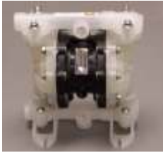
#DDPLQTG-50 (1 IN 1 OUT)