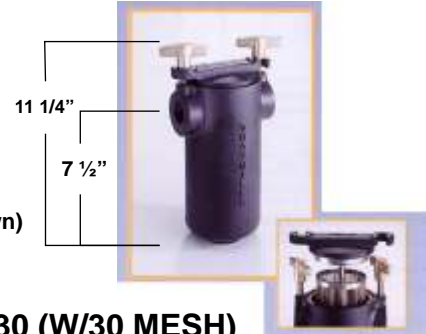
#HFST30 (W/30 MESH) #HFST60 (W/60 MESH)

Cleaning is simple. Just loosen two large cast wing nuts to remove the cover and filter screen cartridge. Filter self-drains when the pump is not operating.