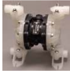
#DDPLQTG-50-2 (2 IN 2 OUT)